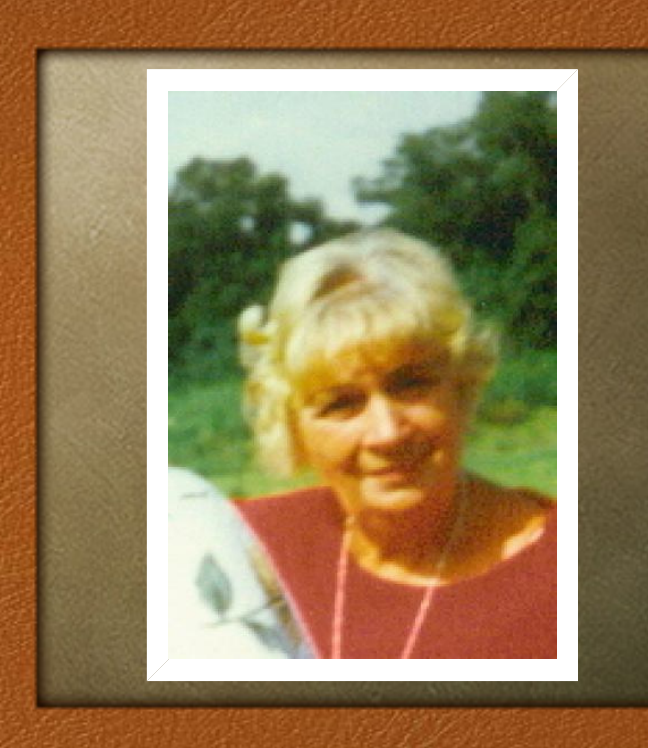
In Loving Memory of